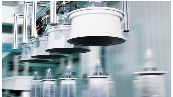
Implementation on turning spindles in the painting area.