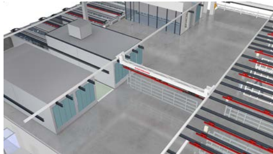
Paint shop for trailer – transfer bridge with carrier set.